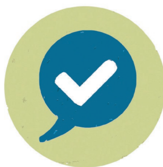
2. Finding words to express themselves