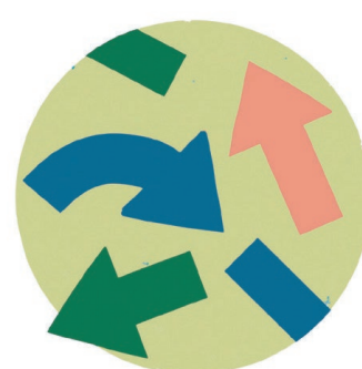
3. Navigating complex, confusing or noisy environments