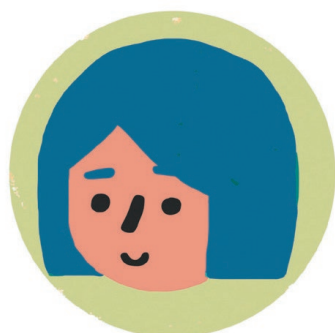
1. Remembering names or specific details, places

Everyday challenges differ for people with dementia. Some common difficulties may include: