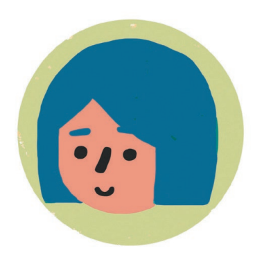
1. Remembering names or specific details, what they set out

Everyday challenges differ for people with dementia. Some common difficulties may include: