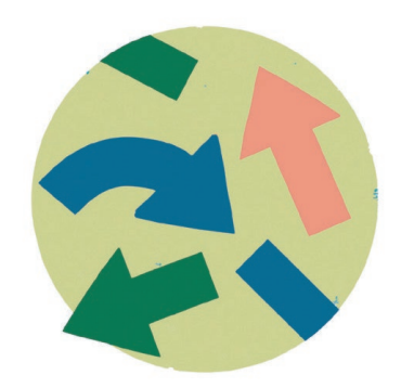
3. Navigating complex, confusing or noisy environments