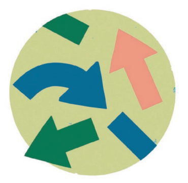
3. Navigating complex, confusing or noisy environments